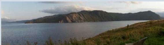
View from Norris Point.