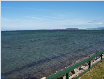
View from the Shallow Bay Motel in Cow Head.